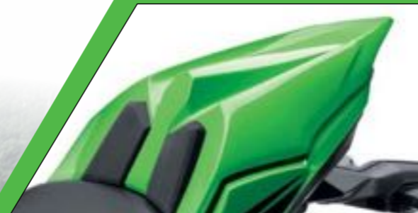
PILLION SEAT COVER