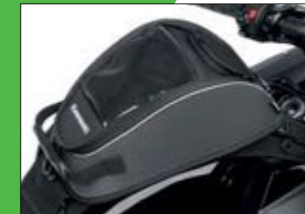
4L TANK BAG