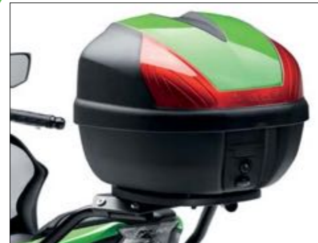
30L TOP CASE