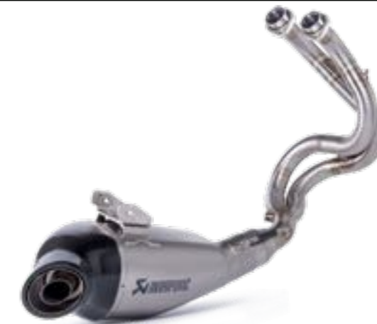
AKRAPOVIČ TITANIUM EXHAUST