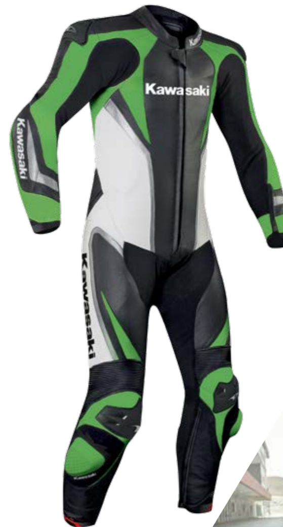
LEATHER SUIT ▲

Be prepared for any riding situation with our stylish range of riding gear. Made from the highest quality materials, our hard wearing clothing accessory range will never let you down. See the whole range at www.kawasaki.eu/accessories