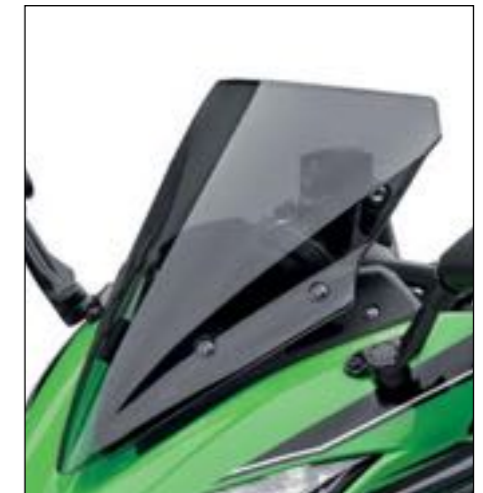
SMOKE AND LARGE SCREEN