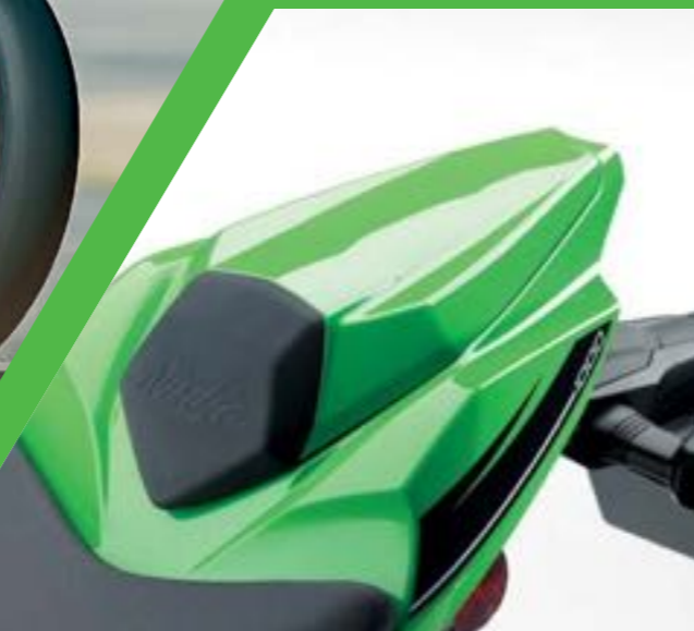
PILLION SEAT COVER