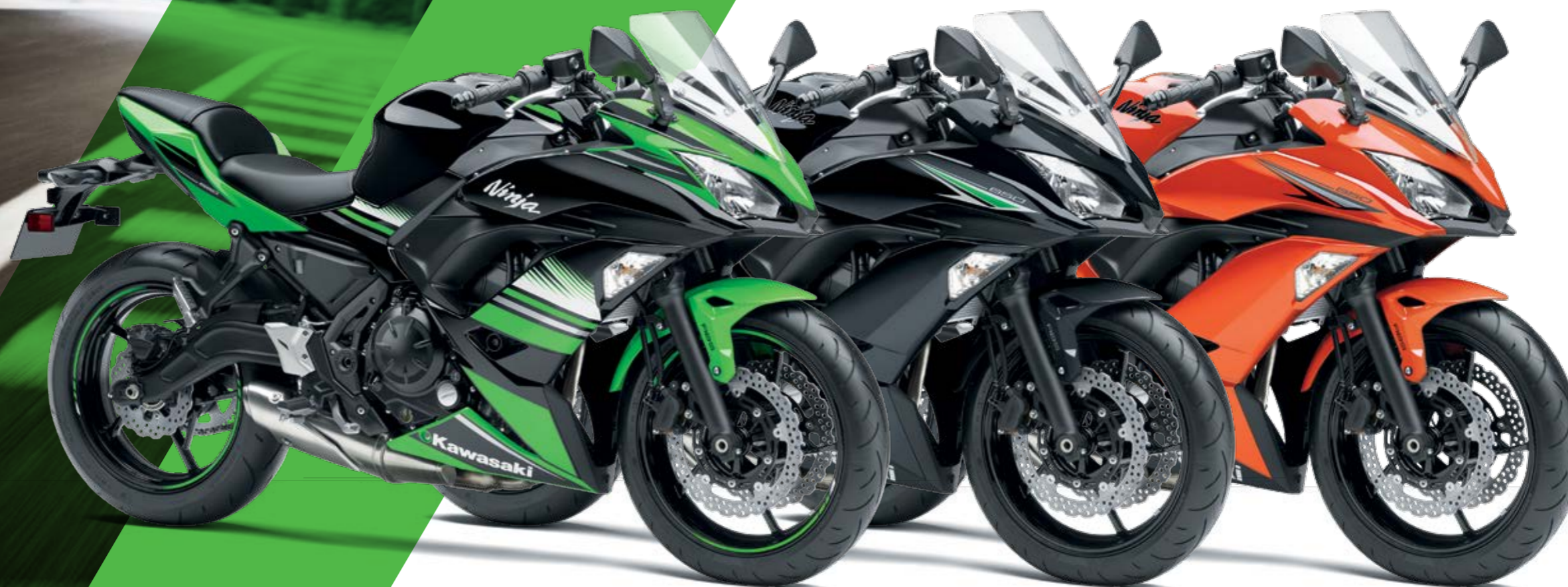
LIME GREEN / EBONY