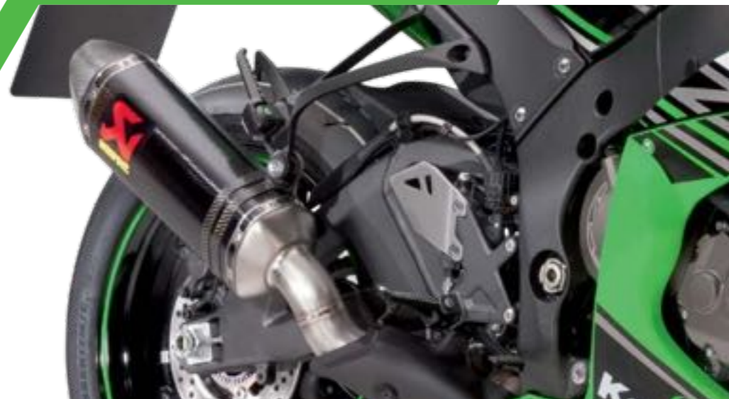
AKRAPOVIČ CARBON SILENCER