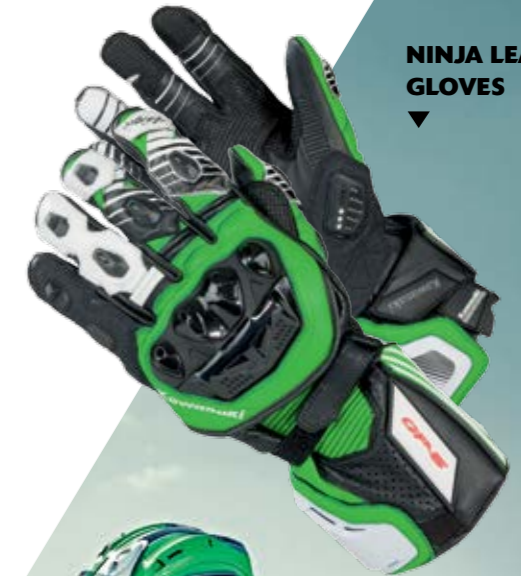
NINJA LEATHER GLOVES ▼