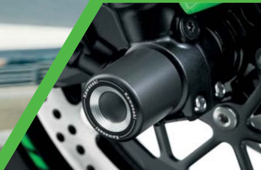
FRONT AXLE PROTECTOR