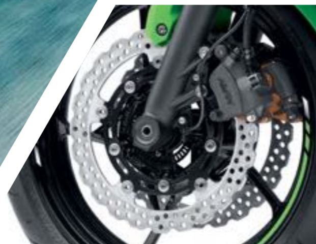
DUAL PISTON CALIPERS, PETAL DISCS