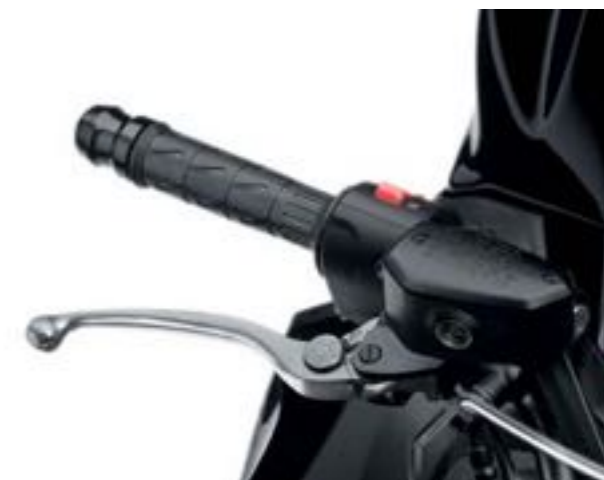
5-WAY ADJUSTABLE CLUTCH AND BRAKE LEVER