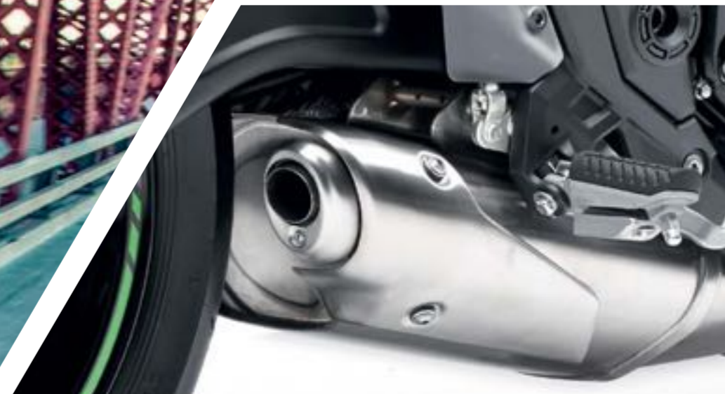
ATTRACTIVE UNDER-ENGINE MUFFLER