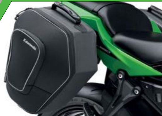
28L SEMI-SOFT PANNIER SET