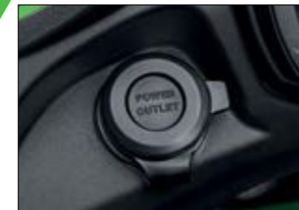
12V POWER OUTLET